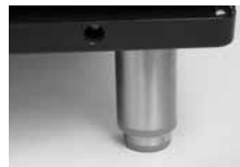
Adjustable legs (from 101-152mm) available with optional leg kit K-00345.